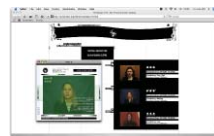
Prototype #44, Net Pirate Number Station by Yoshi Sodeoka, 2004