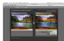
Eclipse by EcoArtTech, 2008