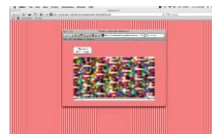
Data Diaries by Cory Arcangel, 2003